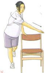
BALANCE AND REACH EXERCISES

B. Stand in the same position as above. While maintaining your arch height, reach the hand farthest away from the chair across your body toward the chair. The farther you reach, the more challenging the exercise. Do 2 sets of 10.