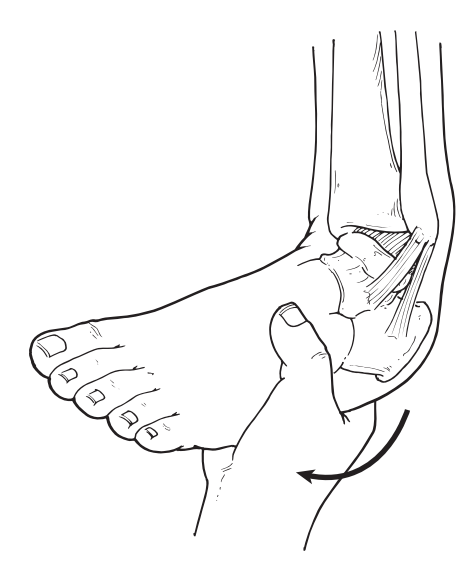
Examination technique: Chronic lateral ankle instability