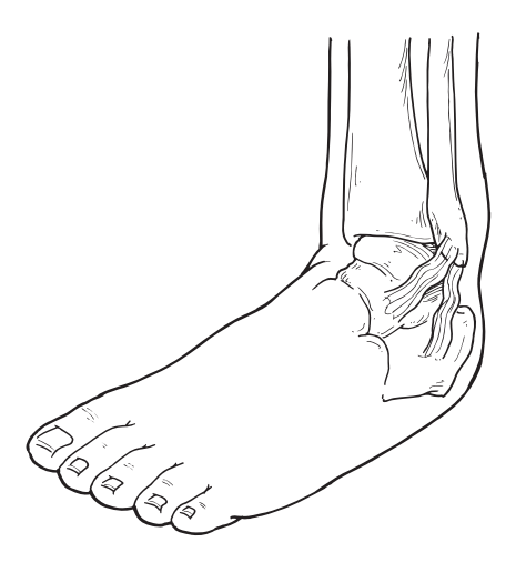
Injured ankle with laxity of ligaments

surgeon will ask you about any previous ankle injuries and instability. Then he or she will examine your ankle to check for tender areas, signs of swelling, and instability of your ankle as shown in the illustration. X-rays, CT scans, or MRIs may be helpful in further evaluating the ankle.